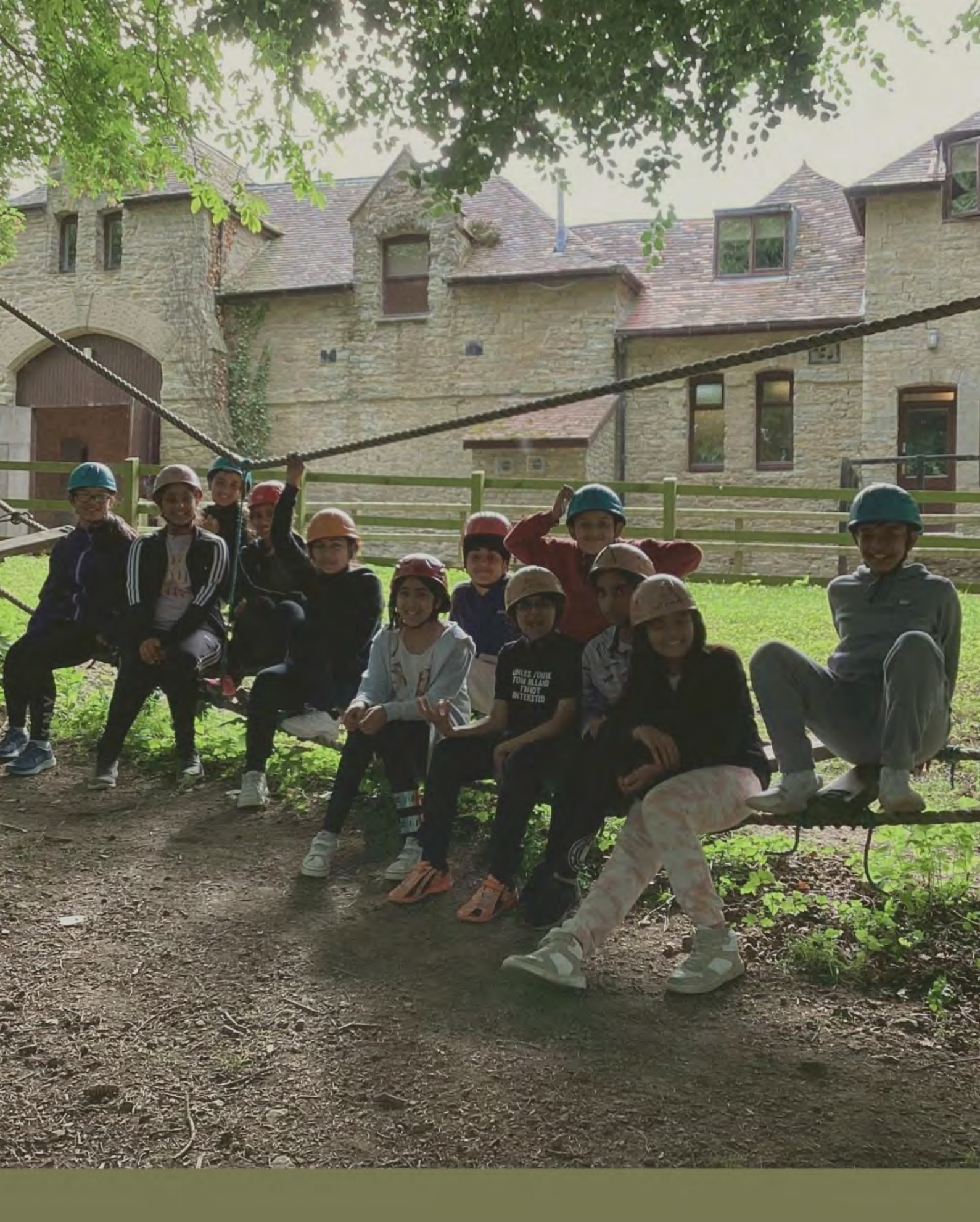
Pupils enjoy the rich and varied experiences that the school offers. They take pride in their school and in their community - Ofsted, 2018