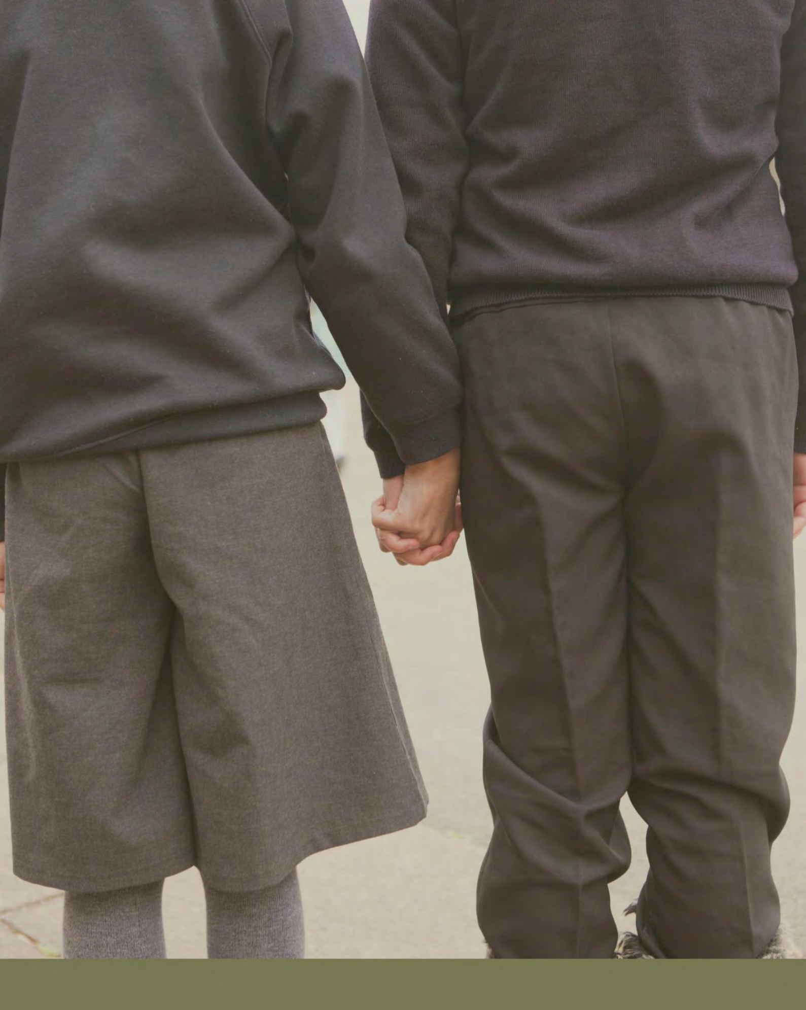
Pupils are well mannered, respectful and courteous towards each other and adults. – Ofsted, 2018