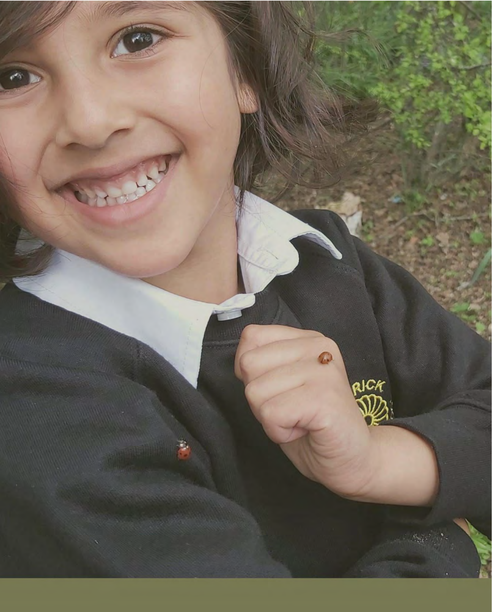
Children make good progress, and often their progress is substantial- Ofsted, 2018