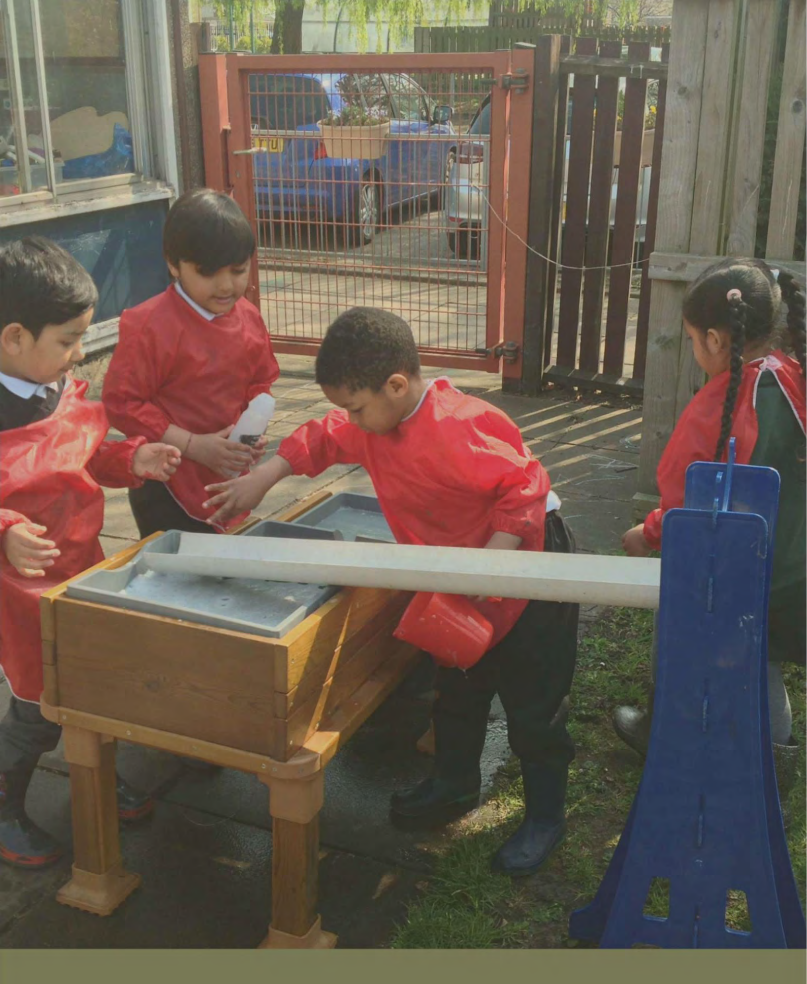
Pupils explained [...] how they learn to keep themselves safe. They [said] that they feel safe in school- Ofsted, 2018